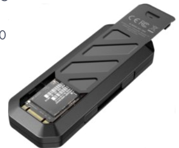
* Holder Storage for 2nd. M.2 SSD